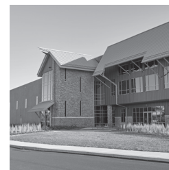
Quality Bicycle Products Lancaster, PA