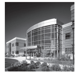
PA College of Health Sciences Lancaster, PA