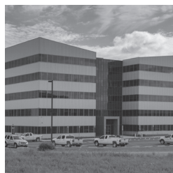
Chesapeake Energy Athens, PA