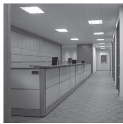
Post & Schell Harrisburg, PA