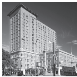
Marriott at Penn Square Lancaster, PA