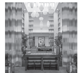
Hilton Garden Inn Valley Forge/Oaks Phoenixville, PA