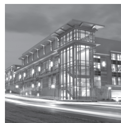
Messiah College Mechanicsburg, PA