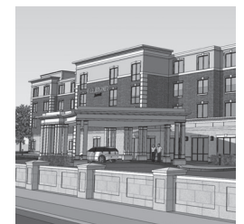
Courtyard by Marriott Hersey, PA