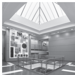
Elizabethtown College Elizabethtown, PA