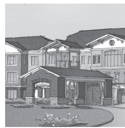
Landis Homes Lititz, PA