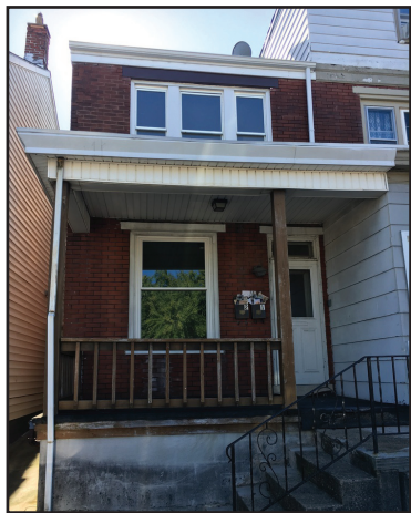
2815 Penbrook Ave.

LEMOYNE, PA — The multi-family investment property located at 2815 Penbrook Ave. in Dauphin County, was recently purchased by N&R Group, LLC from CPENN Patriot Properties – Midtown, LLC.