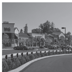
Oaks Shopping Center Norristown, PA