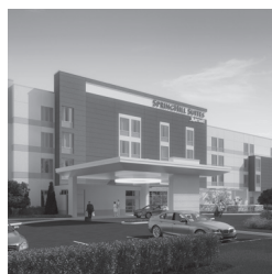
SpringHill Suites Mt. Laurel, NJ