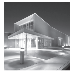
WTF Harrisburg, PA