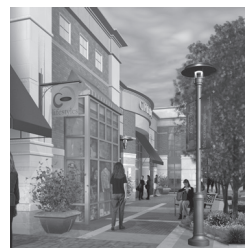
The Crossings at Conestoga Creek Lancaster, PA