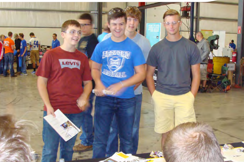
Students visited 16 exhibits to learn about opportunities including a stop at this Kennametal exhibit.