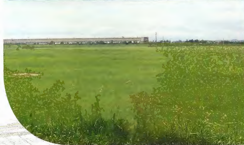
BELOW: BCBP II after construction with REI – East Coast Distribution Center in background.