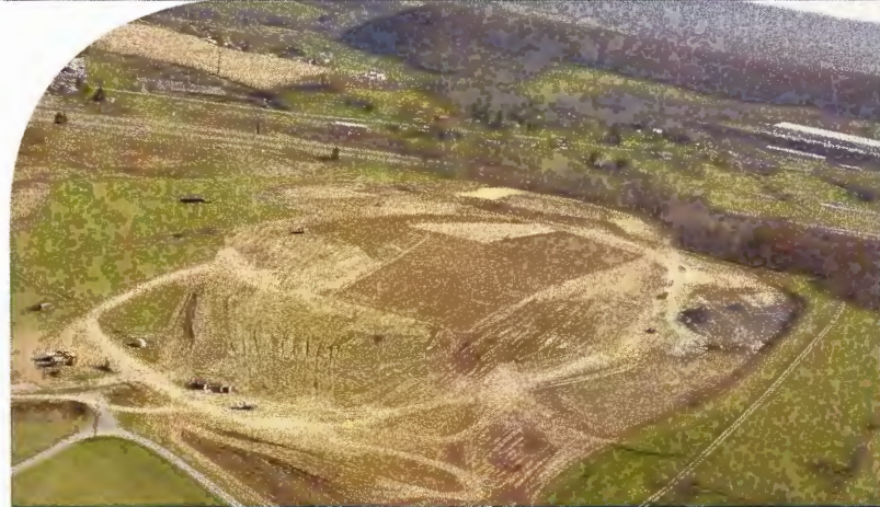
ABOVE: Aerial view of BCBP II during construction with REI Distribution Center in the background.