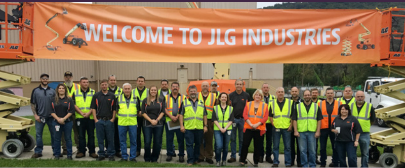
The JLG team hosted a very successful 2018 Manufacturing Day at its Sunnyside Road facility.