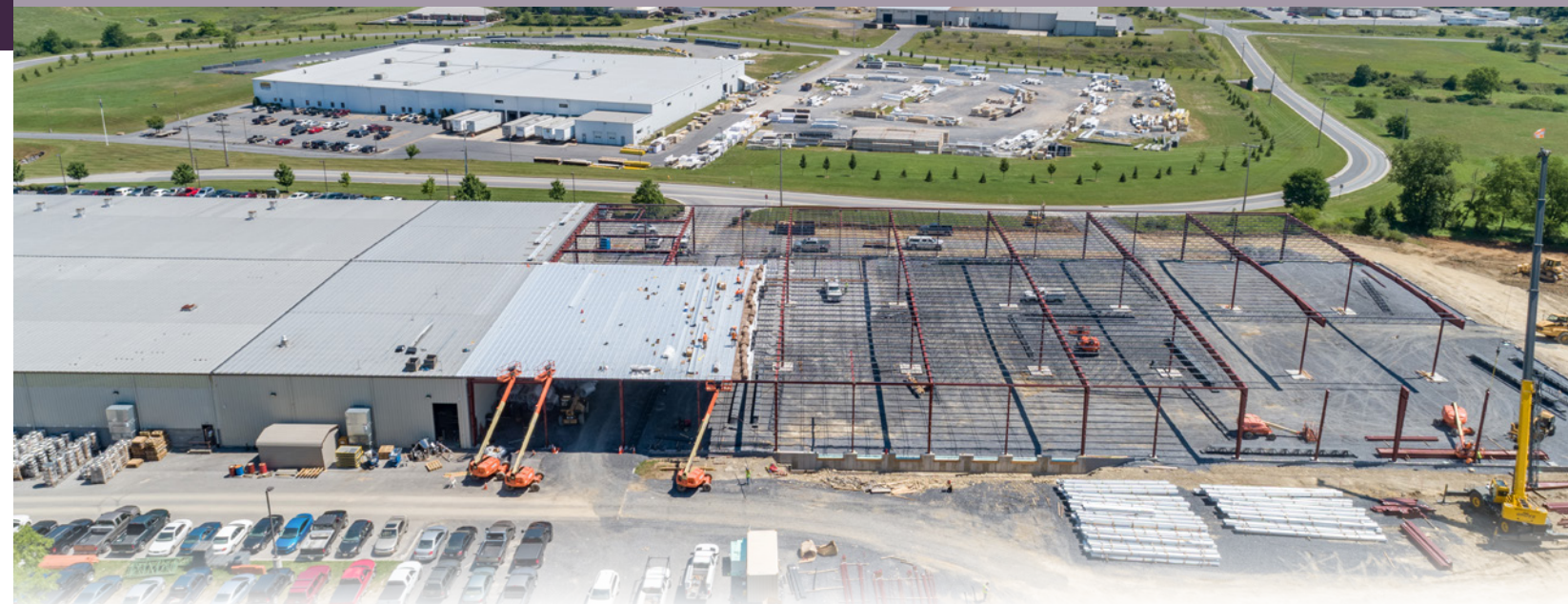
CaptiveAire is doubling the size of its facility in Bedford County Business Park I as a part of its $11 million expansion project.

CaptiveAire, the nation's leading manufacturer of commercial kitchen ventilation systems and an emerging manufacturer of HVAC equipment, is doubling the size of its Bedford plant.